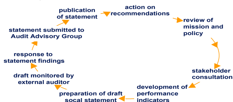
diagram from The Values Report 1997, The Body Shop International

There are four 'building blocks' used in the social audit method: