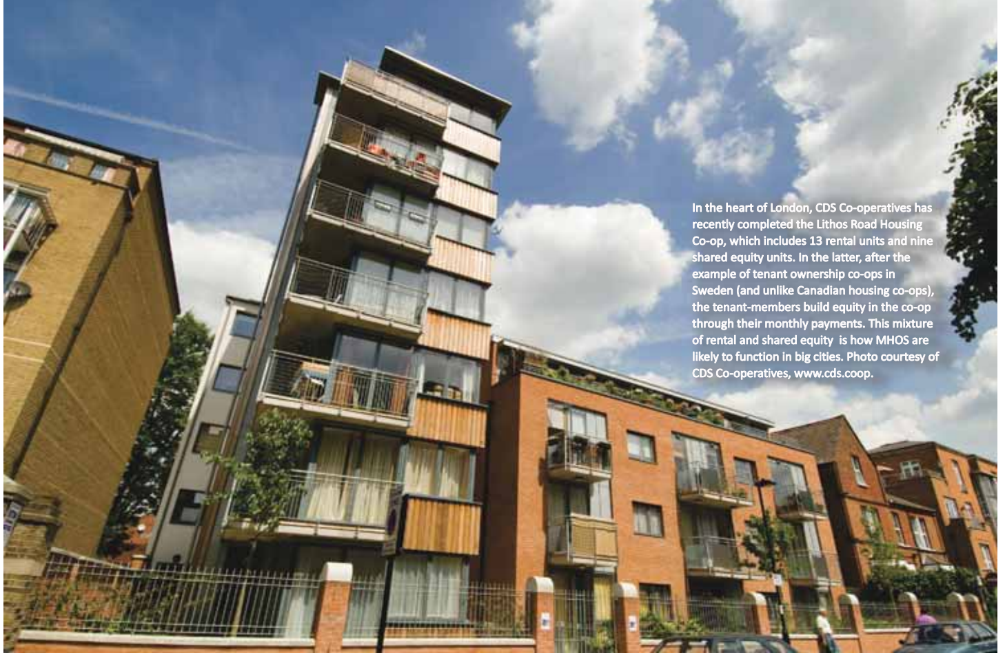
In the heart of London, CDS Co-operatives has recently completed the Lithos Road Housing Co-op, which includes 13 rental units and nine shared equity units. In the latter, after the example of tenant ownership co-ops in Sweden (and unlike Canadian housing co-ops), the tenant-members build equity in the co-op through their monthly payments. This mixture of rental and shared equity is how MHOS are likely to function in big cities.

The key is the monthly payment (line 4) and the equity shares funded and “owned” by the member (Line 8). The corporate debt that a leaseholder services through his/her lease payments or deposit is progressively converted into equity shares. As members service the debt of the co-operative at different levels (because their payments are income-related), it is fair that they “own” units of equity, represented as their household’s shares in the mutually-owned housing assets. The net value of the member’s equity shares increase in value as the collective corporate loan is repaid and in line with the increase in average earnings over time. (This assumes that average earnings increase. If they do not, equity share values could fall.) Line 5 shows the smaller and larger portions of debt to be repaid by members with different levels of income.