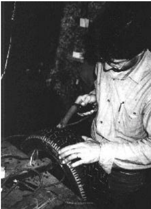
Figure 3: Following the grooves is a Labour –intensive process.

Secondary reuse of whole tyres is the next step in the waste management hierarchy. Tyres are often put to use because of their shape, weight, form or volume. Some examples of secondary use in industrialised countries include use for erosion control, as tree guards, in artificial reefs, fences or as garden decoration. In developing countries wells can be lined with old tyres, docks are often lined with old tyres which act as shock absorbers, and similarly crash barriers can be constructed from old tyres. Old inner tubes also have many uses; swimming aids and water containers being two simple examples.