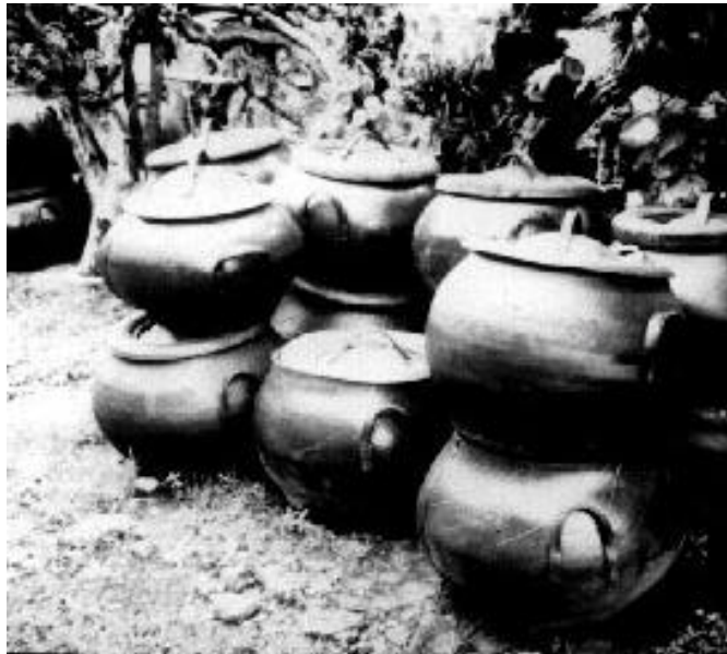
Figure 4: Garbage containers made from Truck tyres. Manila, The Philippines

Another way in which physical reuse can be achieved is by reducing the tyre to a granular form and then reprocessing. This can be a costly process and there has to be a manufacturer willing to purchase the granules. Crumb rubber from the retreading process can be used in this way, as it is a good quality granulated rubber. The reprocessing techniques used are similar to those described in earlier chapters. Granulate tends to be used for low-grade products such as automobile floor mats, shoe soles, rubber wheels for carts and barrows, etc., and can be added to asphalt for road construction, where it improved the properties of this material.