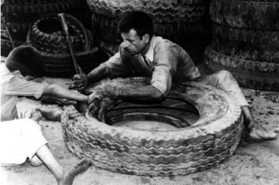
Figure 2: Manual Separation of the Tread from the Sidewalls, Karachi, Pakistan

In Karachi, Pakistan, for example, tyres are collected and cut into parts to obtain secondary materials which can be put to good use. The beads of the tyres are removed and the rubber removed by burning to expose the steel. The tread and sidewalls are separated – the tread is cut into thin strips and used to cover the wheels of donkey carts, while the sidewalls are used for the production of items such as shoe soles, slippers or washers (WAREN Report).