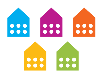
They find a few other housing co-ops that want to work together.