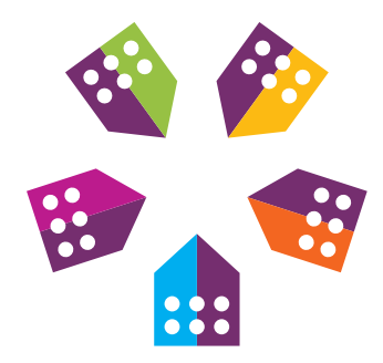
The co-ops transfer ownership of part of their property to the cluster.