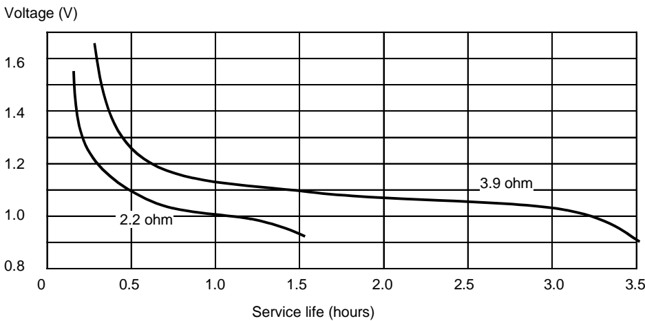
Figure 2: Continuous rate of discharge of a typical zinc-carbon C-sized cell

As a cell discharges its voltage falls. A fresh zinc-carbon cell may have an open voltage of 1.5V, for example, but towards the end of its useful life the voltage will fall to around 0.8 to 0.9V.