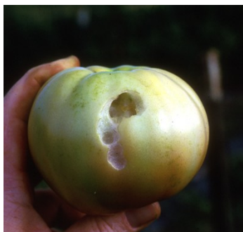
Hornworm damage on tomato

Hornworm damage usually begins to occur in midsummer and continues throughout the remainder of the growing season. The size of these garden pests allows them to quickly defoliate tomatoes, potatoes, eggplants, and peppers. Occasionally, they may also feed on green fruit. Gardeners are likely to spot the large areas of damage at the top of a plant before they see the culprit.