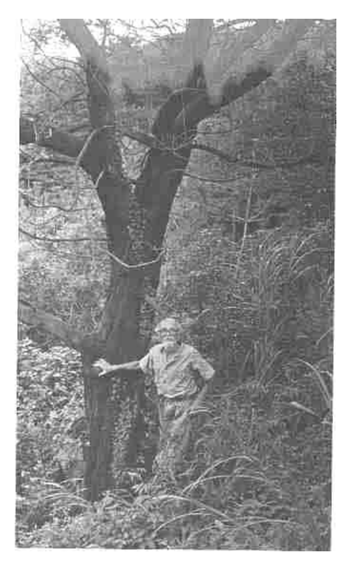
"In nature, the world of relativity does not exist."

People choose to attack or to defend. In the ensuing struggle they accuse one another of instigating conflict. It is like clapping your hands and then arguing about which is making the sound, the right hand or the left. In all contentions there is neither right nor wrong, neither good nor bad. All conscious distinctions arise at the same time and all are mistaken.