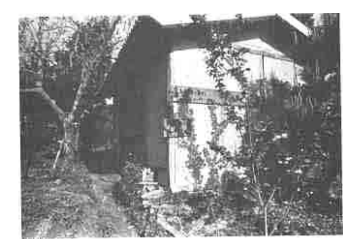
A mudwalled hut in the orchard.

Among agricultural chemicals, herbicides are probably the most difficult to dissuade farmers from using. Since ancient times the farmer has been afflicted with what might be termed "the battle against the weeds." Plowing, cultivating between the rows, the ritual of rice transplanting itself, all are mainly aimed at eliminating weeds. Before the development of herbicides, a farmer had to walk many miles through the flooded rice fields each season, pushing a weeding tool up and down the rows and pulling weeds by hand. It is easy to understand why these chemicals were received as a godsend. In the use of straw and clover and the temporary flooding of the fields, I have found a simple way to control weeds without either the hot, hard labor of weeding or the use of chemicals.