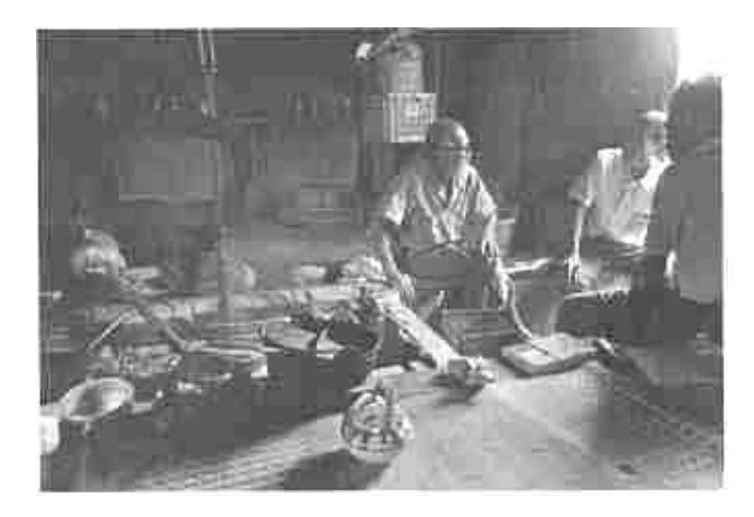
"There is no time in modern agriculture for a farmer to write a poem or compose a song."

To break experience in half and call one side physical and the other spiritual is narrowing and confusing. People do not live dependent on food. Ultimately, we cannot know what food is. It would be better if people stopped even thinking about food. Similarly, it would be well if people stopped troubling themselves about discovering the "true meaning of life,-" we can never know the answers to great spiritual questions, but it's all right not to understand . We have been born and are living on the earth to face directly the reality of living.