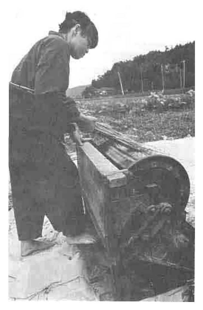
Threshing the crop with the traditional pedal-powered rotating drum (Kyoto). The grains are then winnowed and stored; the straw is returned to the fields.

of burned rice hulls were spread all around, and a prayer was offered that the seedlings would thrive.