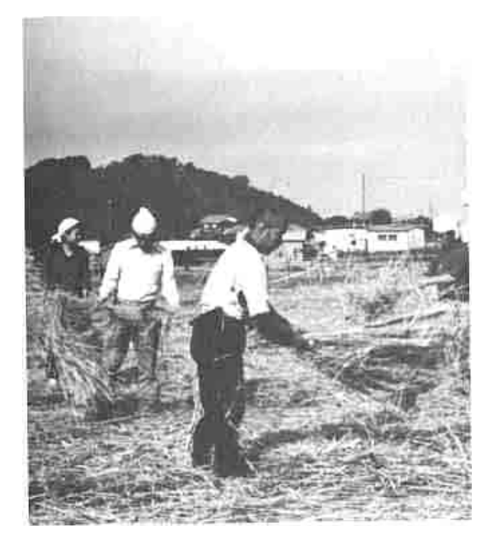
In October, after the rice is harvested and the next year's seed is sown, straw is scattered across the field.

If rice is sown in the autumn and left uncovered, the seeds are often eaten by mice and birds, or they sometimes rot on the ground, and so I enclose the rice seeds in little clay pellets before sowing. The seed is spread out on a flat pan or basket and shaken back and forth in a circular motion. Fine powdered clay is dusted over them and a thin mist of water is added from time to time. This forms a tiny pellet about a half inch in diameter.