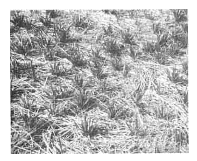
By December the winter grain sprouts through the straw; the rice seeds remain dormant until spring.

This way of farming has evolved according to the natural conditions of the Japanese islands, but I feel that natural farming could also be applied in other areas and to the raising of other indigenous crops. In areas where water is not so readily available, for example, upland rice or other grains such as buckwheat, sorghum or millet might be grown. Instead of white clover, another variety of clover, alfalfa, vetch or lupine might prove a more suitable field cover. Natural farming takes a distinctive form in accordance with the unique conditions of the area in which it is applied.