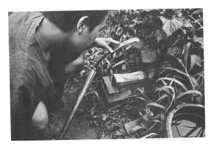
Sharpening a long-handled scythe.

As one might expect, the youths on the mountain do not envy the changeover to mechanization. They enjoy the quiet, peaceful harvest with the old hand sickle.