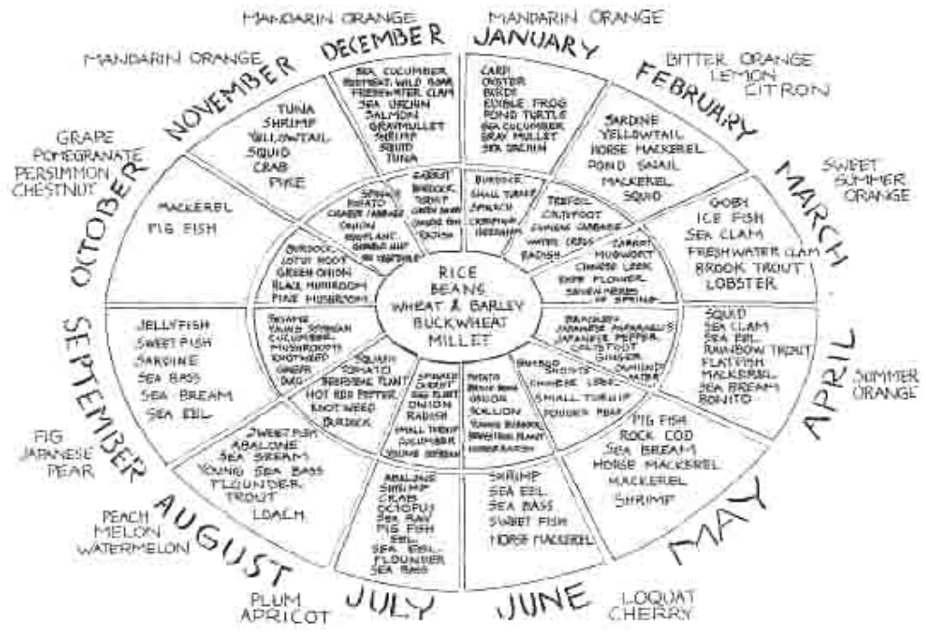
NATURES FOOD MANDALA DIAGRAM TWO

Digging the radishes and turnips which have been left in the ground, covered with a blanket of soil and snow, is an enjoyable experience during the winter season. Grains and various beans grown during the year and miso and soy sauce are staples always on hand. Along with the cabbages, radishes, squash, and sweet potatoes stored in the autumn, a variety of foods are available during the months of bitter cold. Leeks and wild scallions go well with the delicate flavor of oysters and sea cucumbers which can be gathered then.