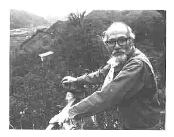
"For thirty years I lived only in my farming...."

To the extent that trees deviate from their natural form, pruning and insect extermination become necessary; to the extent that human society separates itself from a life close to nature, schooling becomes necessary. In nature, formal schooling has no function.