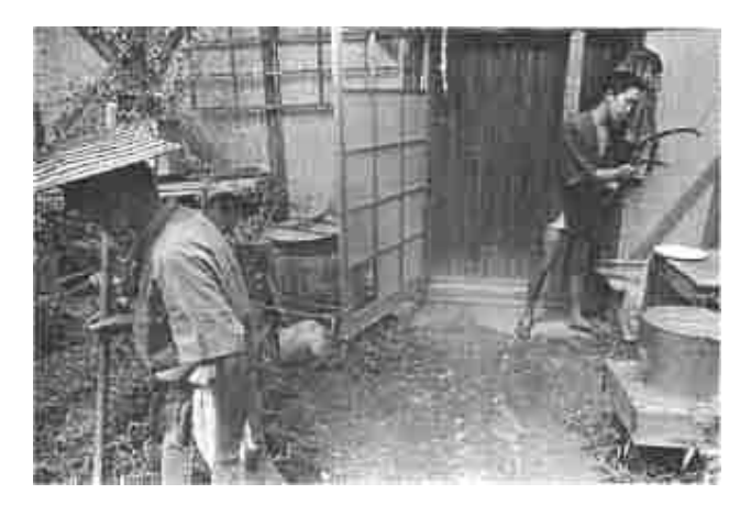
Setting out for a day's work.

artificially enriched feed which is imported from foreign countries and must be bought from the merchants. The local birds scratch around and feed freely on seeds and insects in the area and lay delicious, natural eggs.