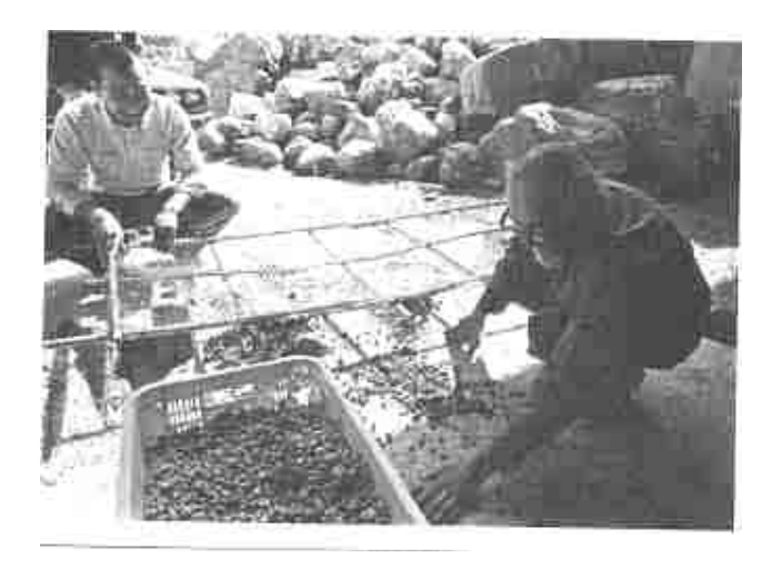
"In one day it is possible to make enough pellets to seed several acres."

If rice is sown in the autumn and left uncovered, the seeds are often eaten by mice and birds, or they sometimes rot on the ground, and so I enclose the rice seeds in little clay pellets before sowing. The seed is spread out on a flat pan or basket and shaken back and forth in a circular motion. Fine powdered clay is dusted over them and a thin mist of water is added from time to time. This forms a tiny pellet about a half inch in diameter.