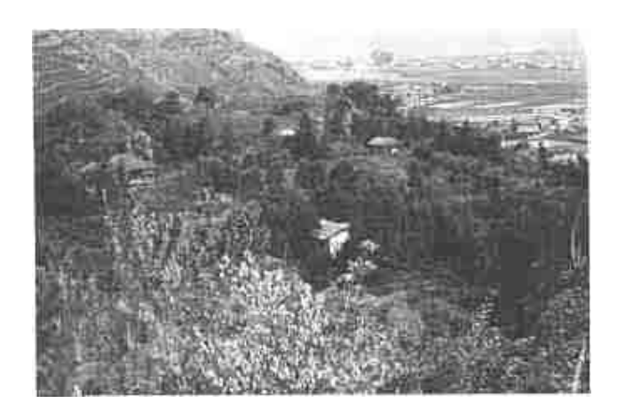
The orchard and huts from the mountain above.

Today, as I watched a group of young people work on a tiny hut, a young woman from Funabashi came walking up.