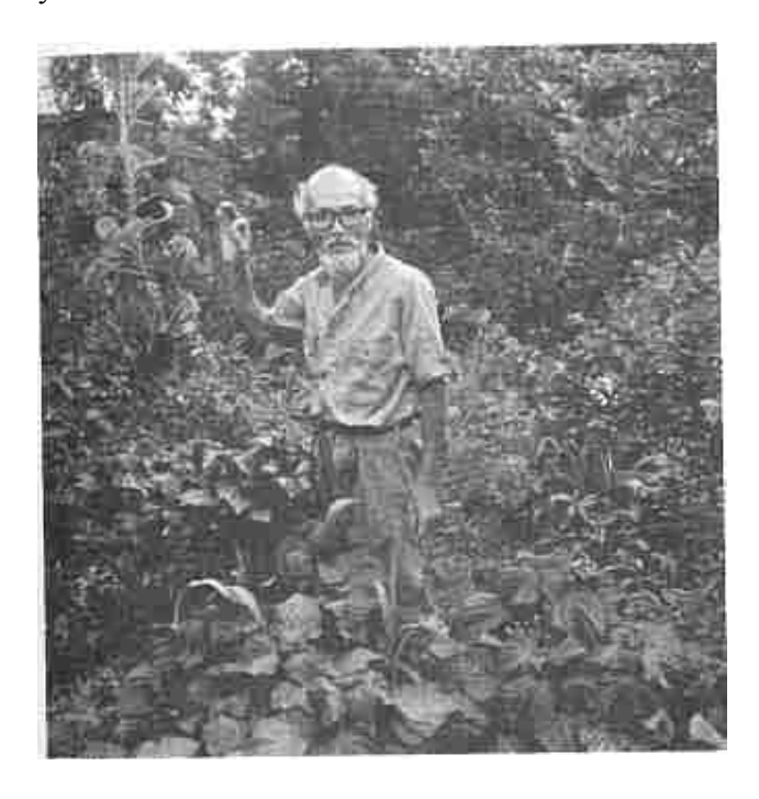
* Ground cover drops such as clover, vetch and alfalfa which condition and nourish the soil

Cut down the natural forest cover, plant Japanese red pine or cedar trees for a few generations, and the soil will become depleted and open to erosion. On the other hand, take a barren mountain with poor, red clay soil, and plant pine or cedar with a ground cover of clover and alfalfa. As the green manure* enriches and softens the soil, weeds and bushes grow up below the trees, and a rich cycle of regeneration is begun. There are instances in which the top four inches of soil have become enriched in less than ten years.