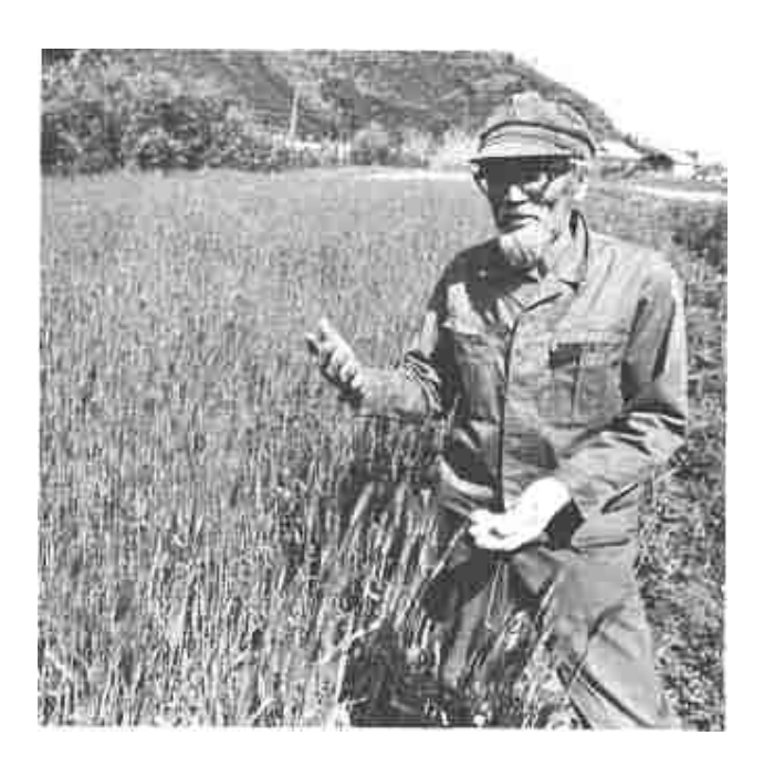
"And yet these fields have not been plowed for twenty-five years."

In caring for a quarter-acre field, one or two people can do all the work of growing rice and winter grain in a matter of a few days. It seems unlikely that there could be a simpler way of raising grain.