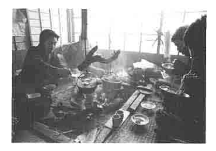
A mid-day meal of soup and rice with pickled vegetables.

When I had gone this far, the youth asked, "Then you not only deny natural science, but also the Oriental philosophies based on yin-yang and the I Ching?"