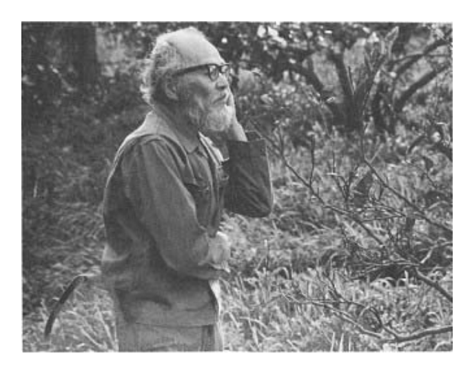
"We have come to the point at which there is no other way than to bring about a 'movement' not to bring anything about."

People find something out, learn how it works, and put nature to use, thinking this will be for the good of humankind. The result of all this, up to now, is that the planet has become polluted, people have become confused, and we have invited in the chaos of modern times.