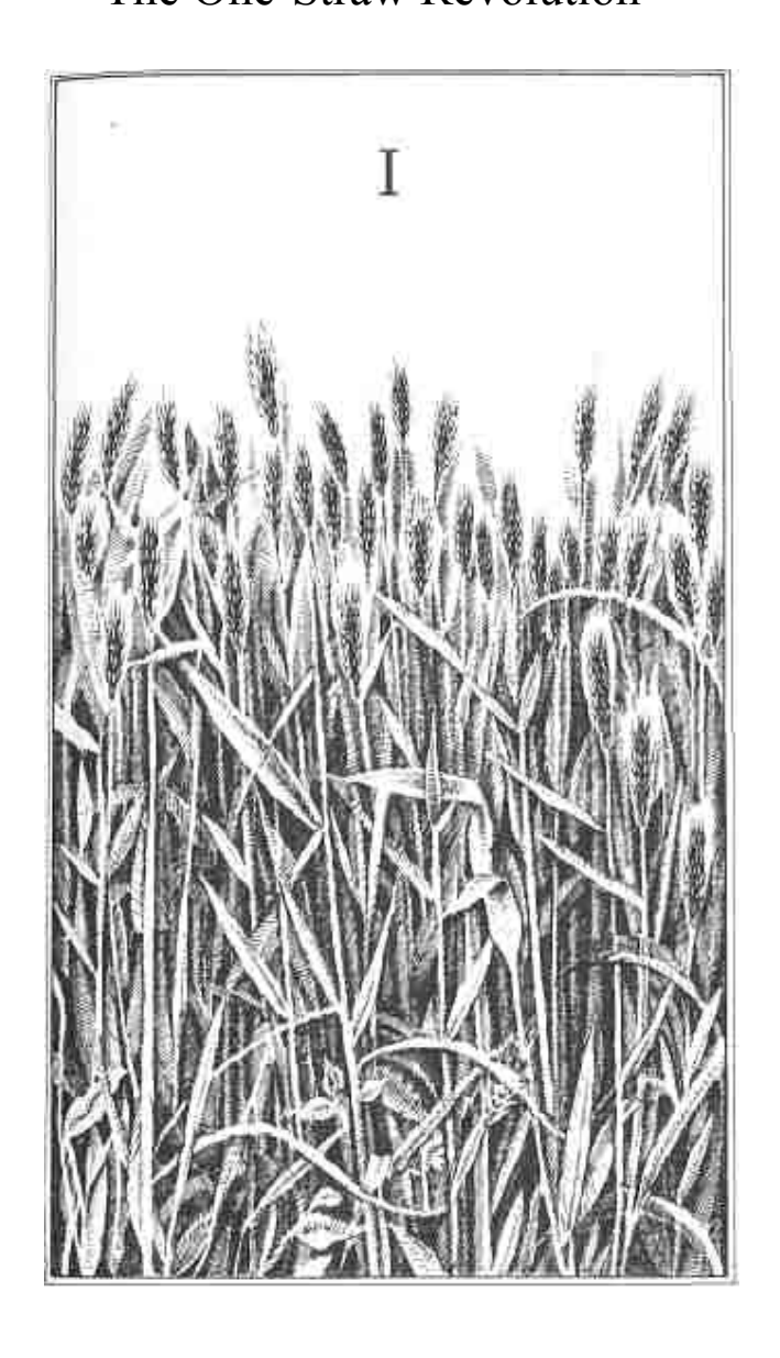
The One-Straw Revolution