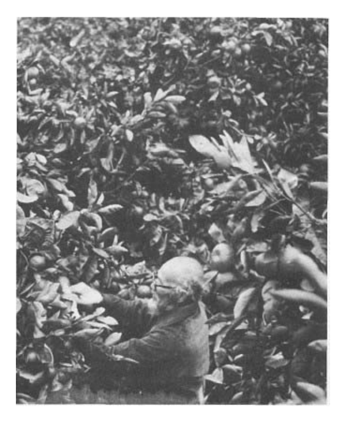
"Twenty years ago the face of this mountain was bare red clay so hard you could not stick a shovel into it."

This tree was introduced to Japan from Australia some years ago and grows faster than any tree I have ever seen. It sends out a deep root in just a few months and in six or seven years it stands as tall as a telephone pole. In addition, this tree is a nitrogen fixer, so if 6 to 10 trees are planted to the quarter acre, soil improvement can be carried out in the deep soil strata and there is no need to break your back hauling logs down the mountain.