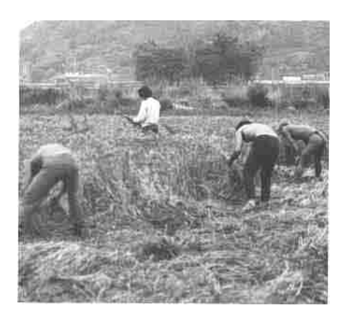
The winter grain is harvested in May. The rice seedlings are trampled by the feet of the harvesters but soon recover.