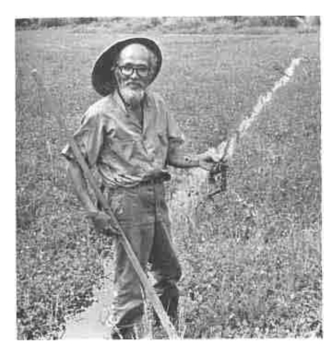
In June water is held in the field to weaken the weeds and clover and allow the rice to sprout through the ground cover.

In June, during the monsoon season, I hold water in the field for about one week. Few of the dry-field weeds can survive even so short a period without oxygen, and the clover also withers and turns yellow. The idea is not to kill the clover, but only to weaken it so as to allow the rice seedlings to get established. When the water is drained (as soon as possible) the clover recovers and spreads to cover the field's surface again beneath the growing rice plants. After that, I hardly do anything in the way of water management. For the first half of the season, I do not irrigate at all. Even in years when very little rain falls the soil stays moist below the layer of straw and green manure. In August I let in water a little at a time but never allow it to stand.