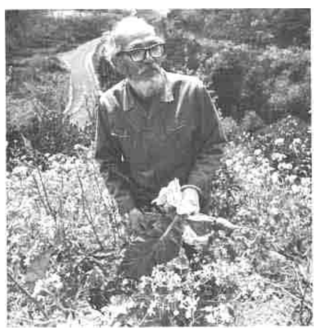
In a patch of mustard and wild turnips.

Among wild foods insects are often overlooked. During the war, when I worked at the research center, I was assigned to determine what insects in Southeast Asia could be eaten. When I investigated this matter, I was amazed to discover that almost any insect is edible.