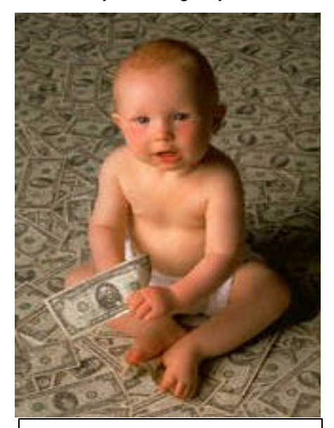
Poor Baby! Here, Let Me Help...

Systems for promoting Community Exchange and Cooperation are easy to design, implement and manage. They promote the formation of transparent and democratic organizations, and community leadership. They have to be that way so that the community has full control over its own development.