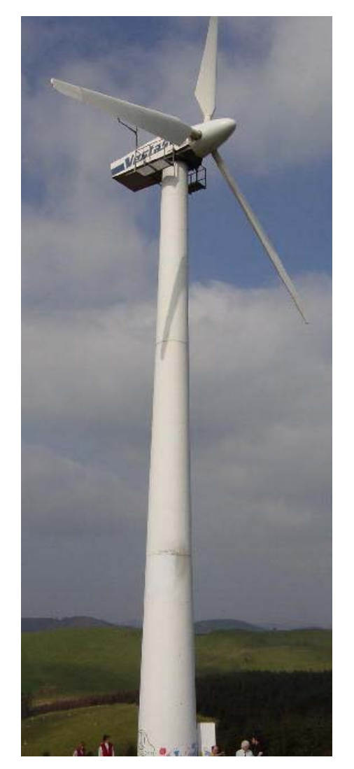
"share in a cleaner future"

an Industrial and Provident Society (IPS)