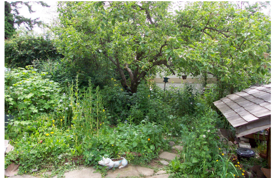
The Oasis, Bellingham, WA

A sustainable and productive way to grow healthy food