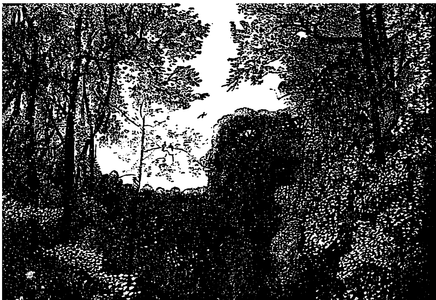
Edited From The Transcript Of The Permaculture Design Course The Rural Education Center, Wilton, NH USA 1981

PUBLISHED BY YANKEE PERMACULTURE Publisher and Distributor of Permaculture Publications P.O. Box 52, Sparr FL 32192-0052 USA YankeePerm@aol.com http://barkingfrogspc.tripod.com/frames.html http://www.permaculture.net/~EPTA/Hemenway.htm