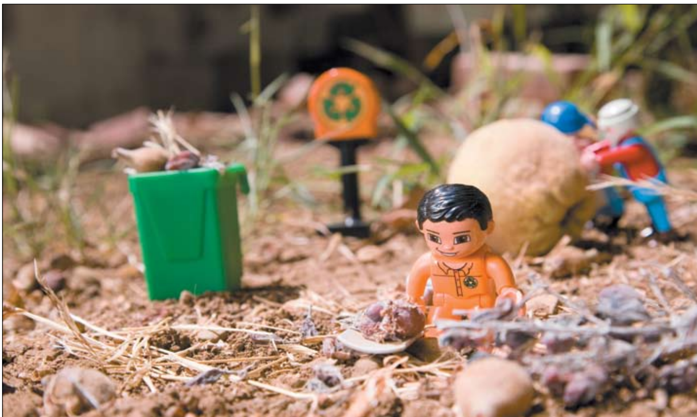
RE-USE AND REDUCE CONSUMPTION: IN A COUNTRY LIKE JORDAN, CAREFUL FARMING AND RECYCLING OF WATER AND ORGANIC WASTE CAN MAKE LAND MORE PRODUCTIVE.