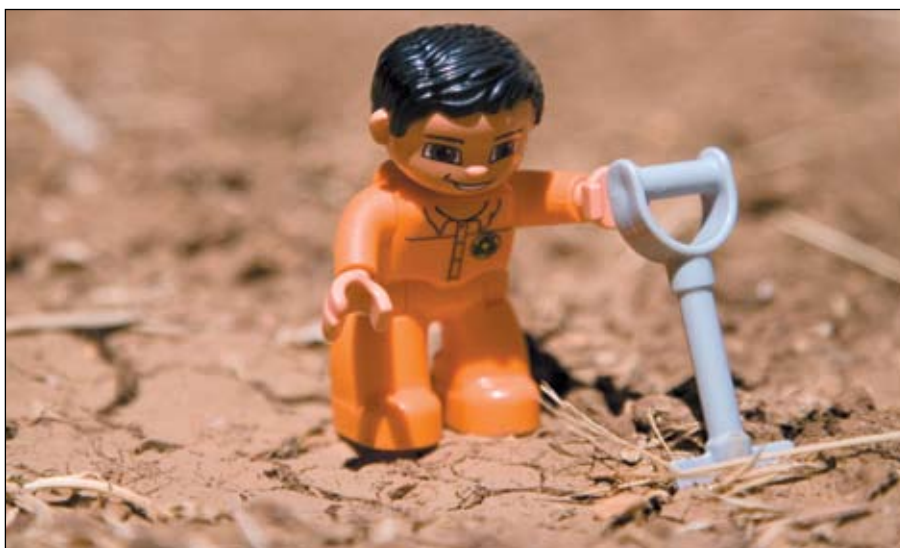
START A GARDEN: MAKING LOCAL LAND AND COMMUNITIES PRODUCTIVE IS ONE OF THE KEYS TO TRANSITION.