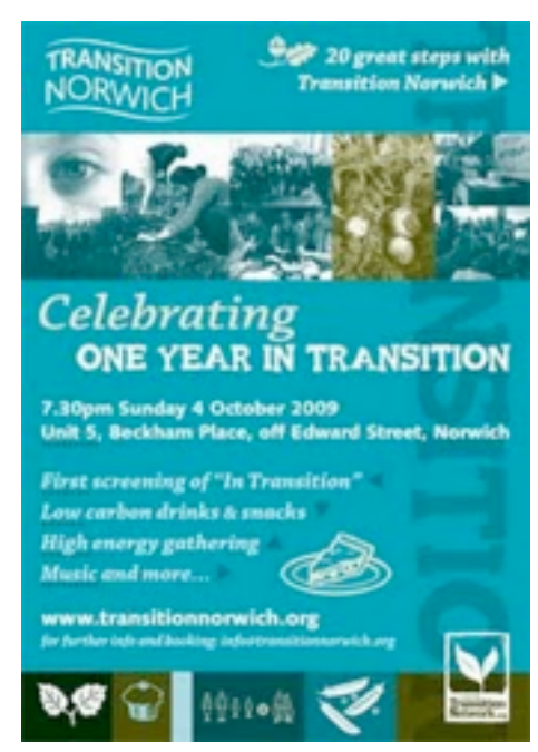
Party Poster! One year of Transition Norwich (Oct. '09)

numbers six people. Outwardly TN is actively engaged with other groups to bring about sustainable change. They are looking at government plans for the region, supporting the sustainable initiatives and challenging the pressure for more roads, houses etc. as well as supporting national campaigns for climate action. Their main in-house focus has shifted towards building up the Resilience Plan (formerly known as the Energy Descent Action Plan!), while the theme groups, ranging from Heart and Soul to Transport to Textiles, having undergone many changes, are now concentrating their efforts on working with this plan. The other two drivers are the Transition Circles and the Communications group which organises events, outside communications, press and publicity and the website (with two blogs) and a monthly bulletin.