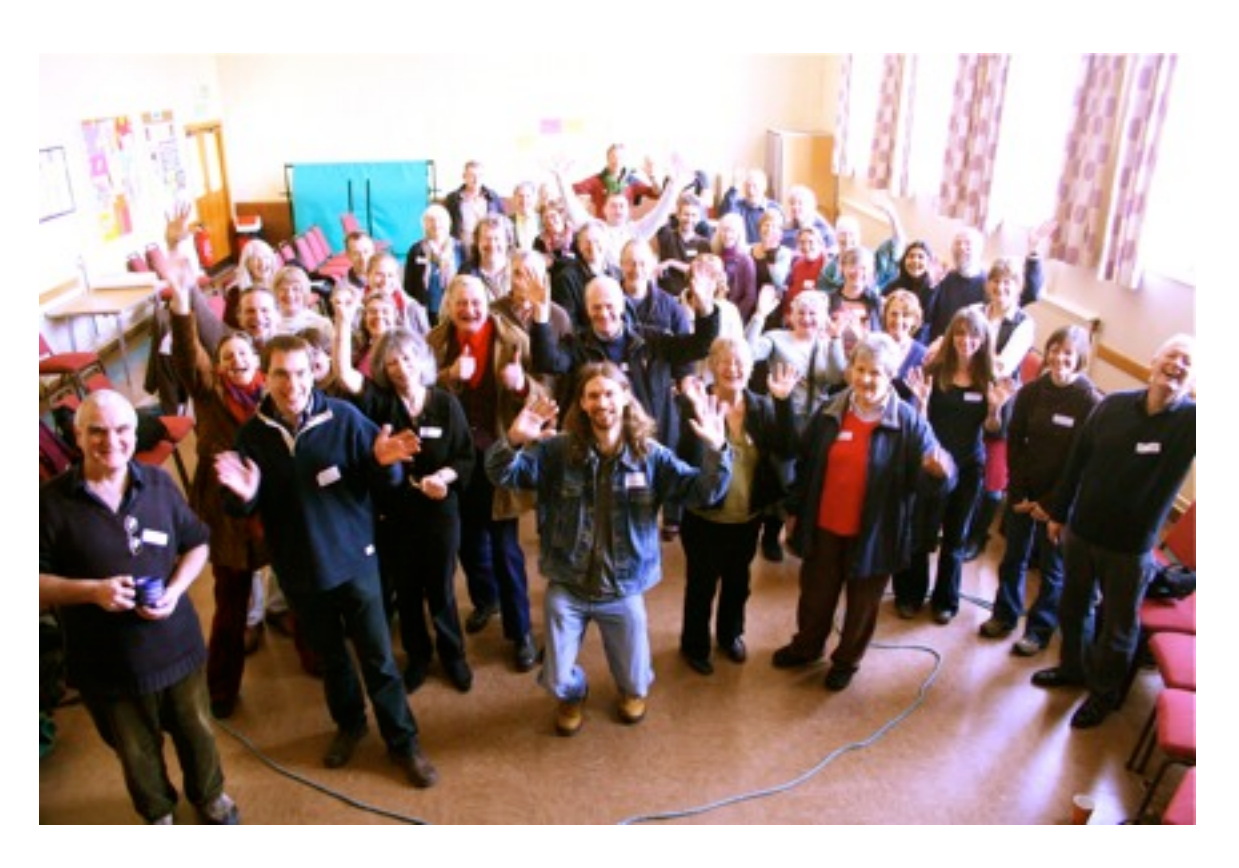
The first Transition East Regional Gathering (7th March 2009) Hosted by Downham and Villages and drawing together 50 people from 12 initiatives

Our main function so far is to report on our own initiatives' activities in the interest of regional coherence, communication and networking. We have also worked to assist Transition Diss in the running of this second TE gathering. We meet in each other's houses and also work closely with the Transition East website.