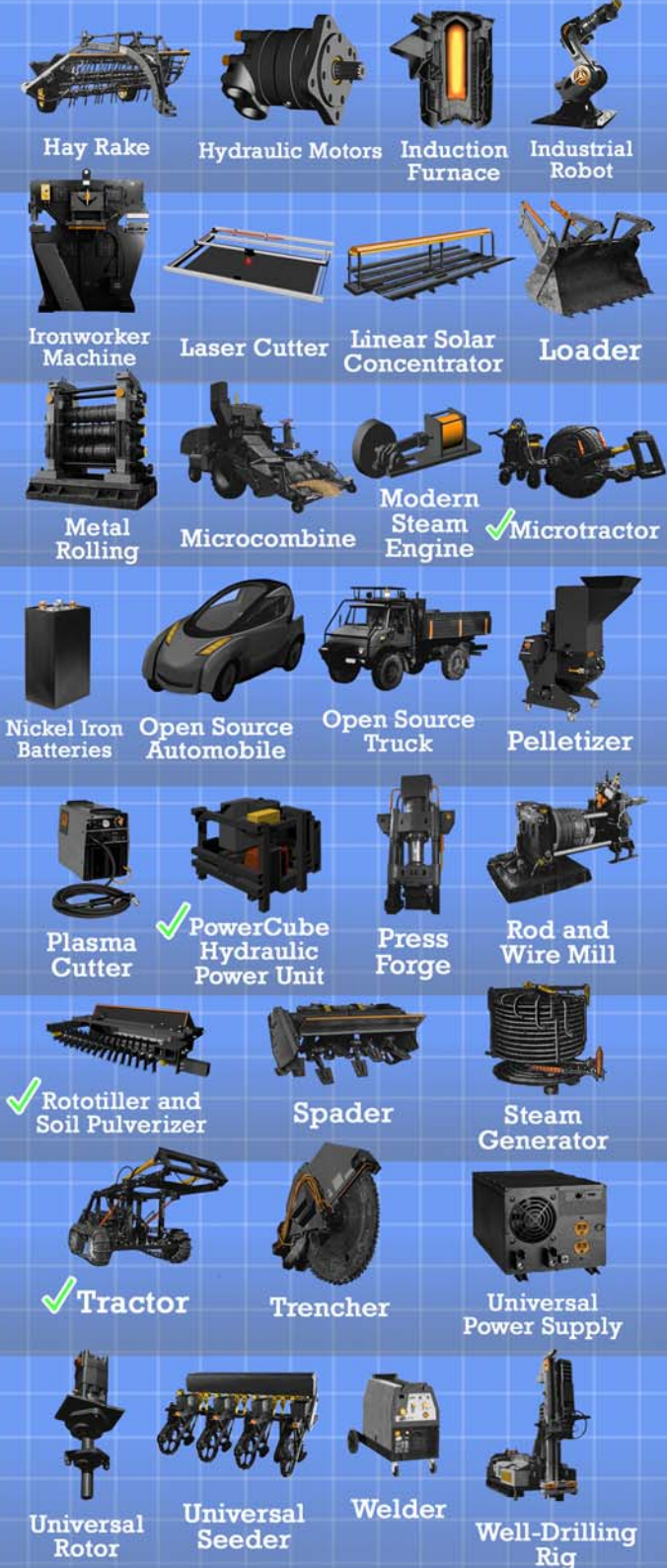
Hay Rake Hydraulic Motors Induction Furnace Industrial Robot