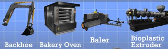
Backhoe Bakery Oven Baler Bioplastic Extruder