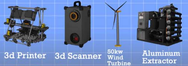
3d Printer 3d Scanner 50kw Wind Turbine Aluminum Extractor