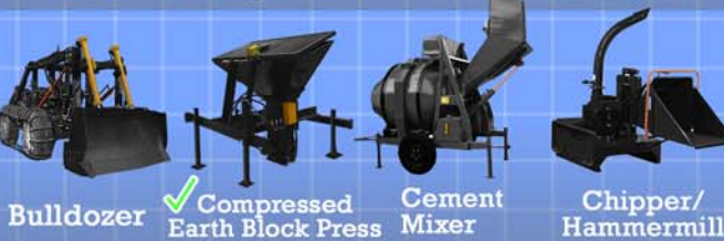
Bulldozer ✓ Compressed Earth Block Press Cement Mixer Chipper/Hammermill