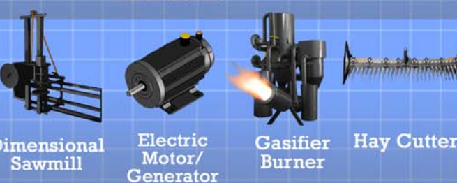
Dimensional Sawmill Electric Motor/Generator Gasifier Burner Hay Cutter