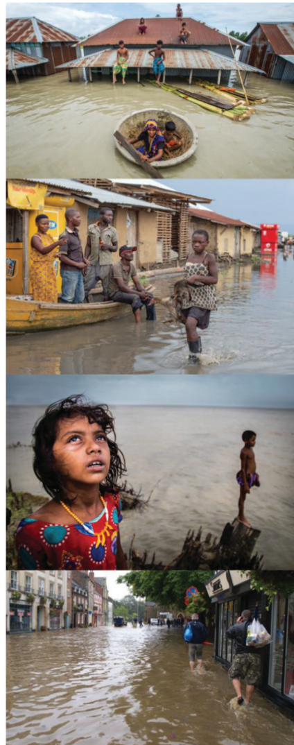
Figure 1. The impacts of climate-related droughts (left column) and floods (right column). Left column (top to bottom): “Children in dust storm” (Ethiopia, 2016; photograph: Anouk Delafortrie/EU/ECHO), a water hole that may have become empty because of drought (Mozambique, 2016; photograph: Aurélie Marrier d’Unienville/IFRC), drought-affected corn field in Paulding County, Ohio (United States, 2012; photograph: US Department of Agriculture/Christina Reed), “Drought in Kenya’s Ewaso Ngiro river basin” (Kenya, 2017; photograph: Denis Onyodi/Denis Onyodi/KRCS). Right column (top to bottom): houses are nearly submerged by flooding (Bangladesh, 2020; photograph: Moniruzzaman Sazal/Climate Visuals Countdown), “A girl, duck in hand wades through the water in Rwangara” (Uganda, 2020; photograph: Climate Centre), “two children a boy and a girl on a flooded riverbank” (Bangladesh, 2018; photograph: Moniruzzaman Sazal/Climate Visuals Countdown), “Residents wade through flooded streets to escape flood waters” (United Kingdom, 2008; John Dal). All photos are licensed under Creative Commons and all quotes are from the Climate Visuals project ( https://climatevisuals.org ). See supplemental file S1 for details and more pictures.

especially in low-income areas that are most vulnerable to climate impacts. More generally, other policy instruments could include investments in innovation and climate finance (supplemental figure S5), positive subsidies, and feed-in tariffs that guarantee an above-market price for renewable energy producers.