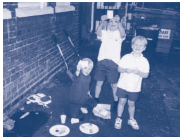
Young members of the Rushey Green Time Bank.