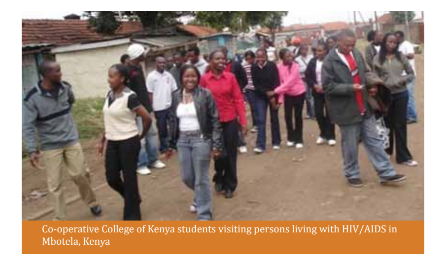
Box 10: Revitalizing the Kenyan apex organization

federations, secondary societies, or by government personnel, especially during the formation stages.