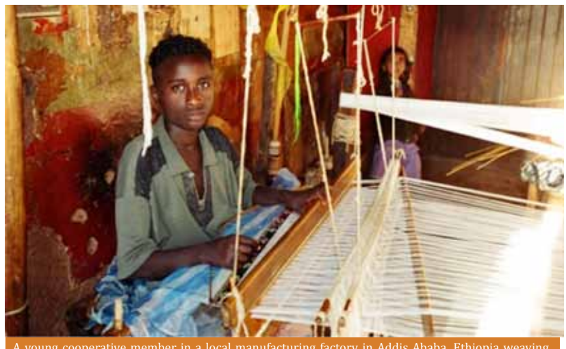
A young cooperative member in a local manufacturing factory in Addis Ababa, Ethiopia weaving