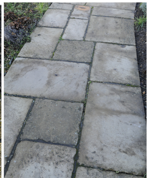
Different paved surfaces