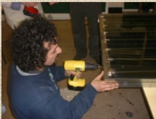
course participants assembling their own panels.

The first thing to do is to choose either