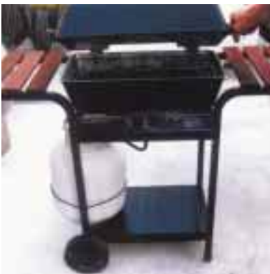
Above: The propane gas barbecue before modification

B arbecuing with hydrogen is cleaner than using charcoal or propane because there's no carbon in hydrogen. When hydrogen burns, it emits only water vapor and traces of nitrogen oxide. No toxic pollutants, smoke, or particulates are released by a hydrogen flame. When hydrogen is produced by renewable energy, the water-to-fuel-to-water cycle can be sustained virtually forever!