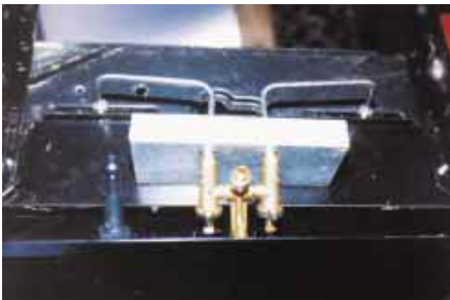
Above: Remove the jets and valve components, before silver-soldering stainless tubing.