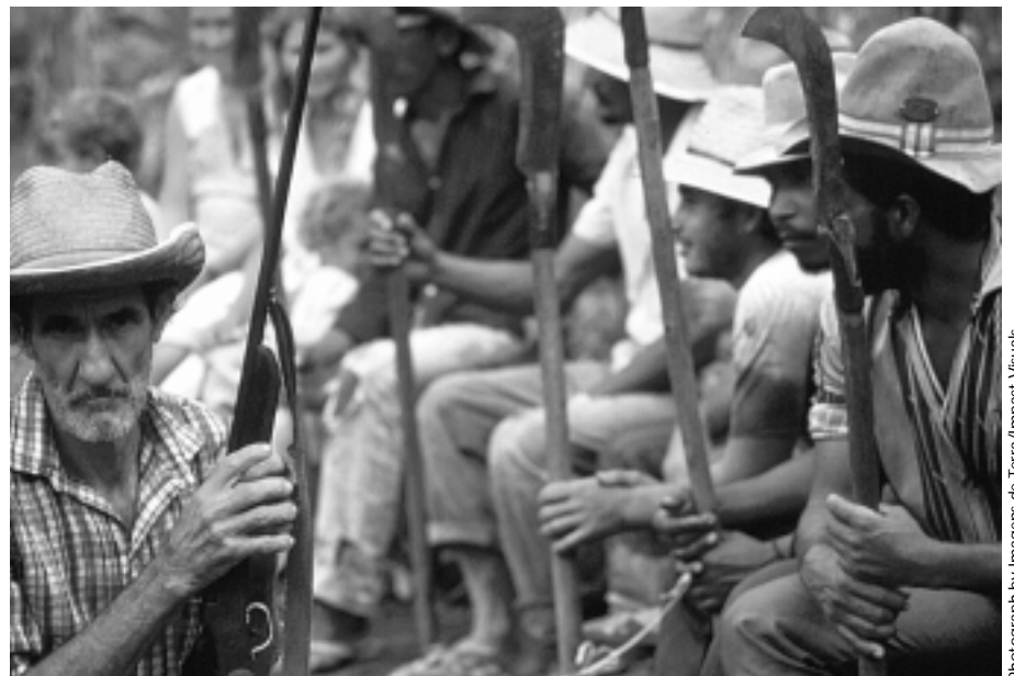
Squatters occupy land owned by the wealthy absentee landlords in Acre, Brazil.

Local and regional economic development benefits from a small farm economy, as do the life and prosperity of rural towns. Can we re-create a small farm economy in places where it has been lost, to improve the well-being of the poor?