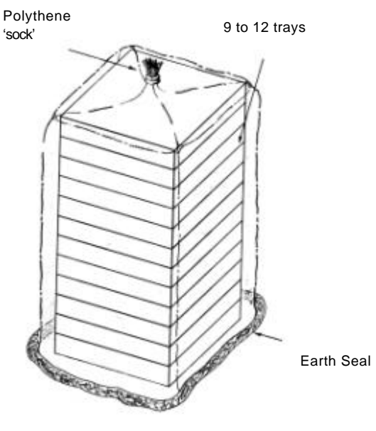
Figure 4: AKRSP Sulphuring tent

The apricots need to be placed in a chamber in which sulphur is burnt for 2-3 hours. Figures 2 and 3 show traditional sulphuring chambers.