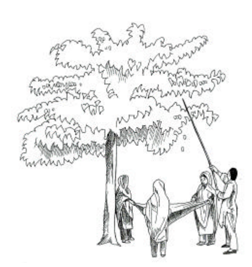
Figure 1: Collecting Apricots

Traditionally, apricots are harvested by shaking branches and letting fruit fall to the ground. The fruit is then either eaten fresh, sun-dried or heaped in fields prior to pit removal. This practice, common in many countries, of shaking the trees and letting the fruit fall to the ground, results in damaged, bruised and dirty fruit. A high quality dried apricot cannot be produced from a poor quality apricot so this method of harvesting should be discouraged. In order to reduce damage, fruit can collected in outspread sheets held above ground level.