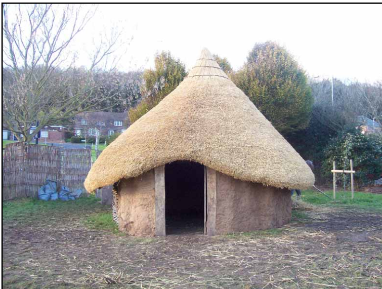
Saxon Roundhouse at Moulsecoomb Primary

We continue to offer work experience to pupils who are having problems with school, in addition to the pupils that visit us through our various partners.