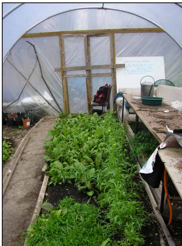
Oriental salad growing in the polytunnel during the winter.

I have continued farming and composting, and bringing my own bags with me when I shop. Respectfully, I will remain committed to supporting local, organic, and fairly traded goods. I am thankful for the time I spent at Moulsecomb.