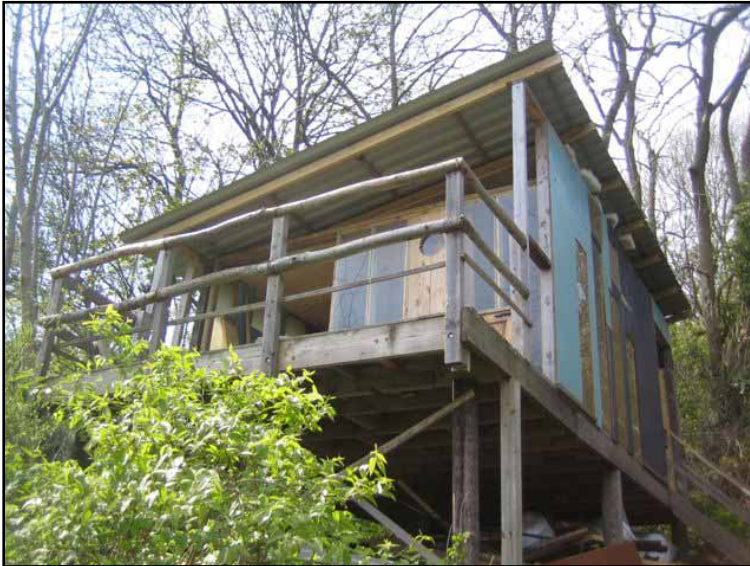
Tree house classroom

We have been building our structure for two years and at last it is nearly complete. Work has been slow as apart from the odd shed building day of adult volunteers it has been built entirely with the young people themselves. The balcony has been re decked, all the walls and roof have been boarded inside and out. We have used recycled wood where ever possible and have insulated the walls and roof with a material made from recycled bottles.