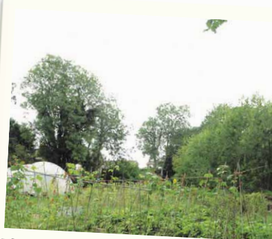
The site is on a steep slope with the wildlife area, shed and polytunnel at the top

All our first-prize winners receive a package of great gardening goodies from our sponsors and all winners and runners-up also receive a certificate to hang on their allotment shed wall to commemorate their achievements.