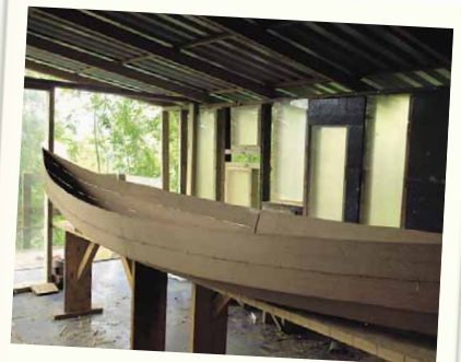
Works in progress - a half built canoe inside the shed that local young offenders are currently constructing

F or many young people in the area, the eight plots that make up the Moulsecoomb Forest Garden and Wildlife Project, winner of the Best Community Project category of the KG allotment competition 2007, are very important. They offer a place to learn important skills, gain some self esteem and have the chance to grow and eat fresh fruit and veg.