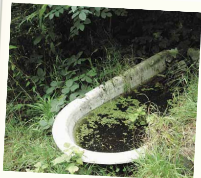
Newts love the improvised pond