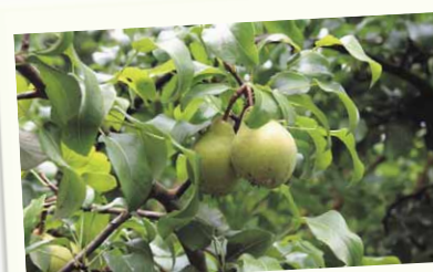
A good crop of pears in the little orchard