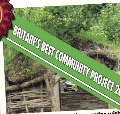
This homemade bower is popular with smaller children visiting the site