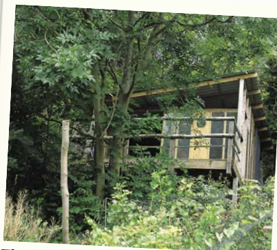
The shed will act as a classroom for the youngsters on wet days