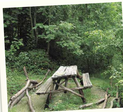
One of many seating areas – this one near the Forest Garden