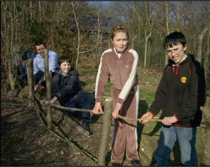
Patcham House school students building a coppiced fence

The reason that MFGWP is a popular volunteering opportunity for students is that there is good solid support available for students to enable them to really get involved with different aspects of the project. Most students have got involved so they can work alongside young people from the Alternative Centre for Education. In addition to this, I recommended volunteering at the MFGWP to a particular student who had on-going mental health issues, as I knew that he would be properly supported and would positively flourish in this environment.