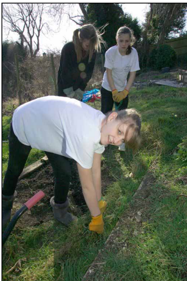
Falmer students digging a vegetable bed

Moulsecoomb Forest Garden and Wildlife Project is a community food project based on eight plots at the Moulsecoomb Place allotment site in Brighton. The project is situated on the north east outskirts of the city between four housing estates: the Bates,