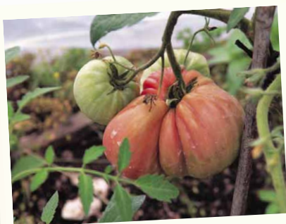
The polytunnel is home to a collection of heritage tomatoes and acts as a dry area for practical gardening lessons