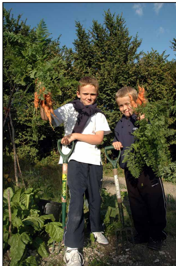
Digging up carrots for Moulsecoomb Primary School harvest festival.

Crucially, the members of the group are all highly skilled, offering a variety of expertise, as well as being very enthusiastic about the projects they engage in.