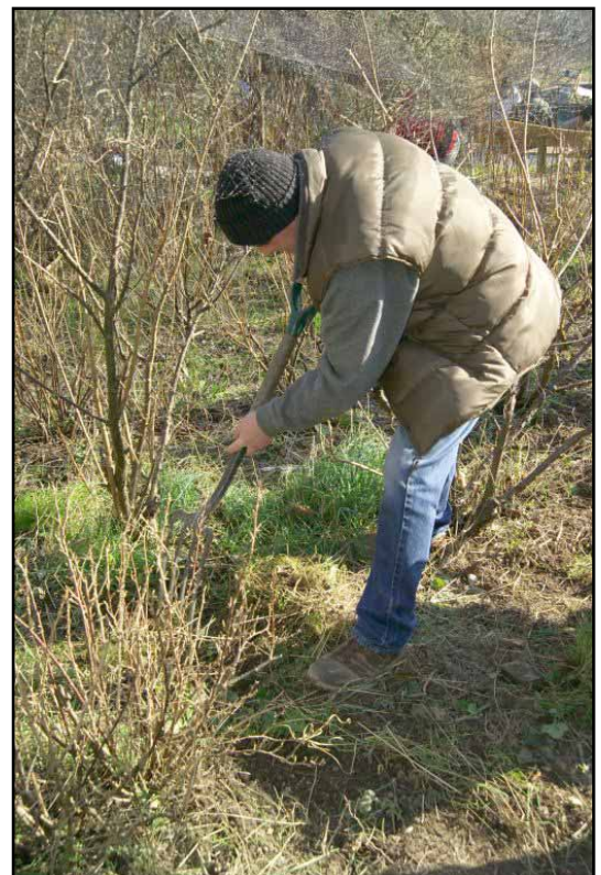
Belgrave Day Centre student digging around the gooseberries

Project V provided hotdogs for everyone and these were cooked by the students from Falmer. When everyone was sitting around the fire eating food and drinking tea there was great atmosphere with everyone talking to everyone, laughing, smiling and enjoying themselves. All in all the day went really