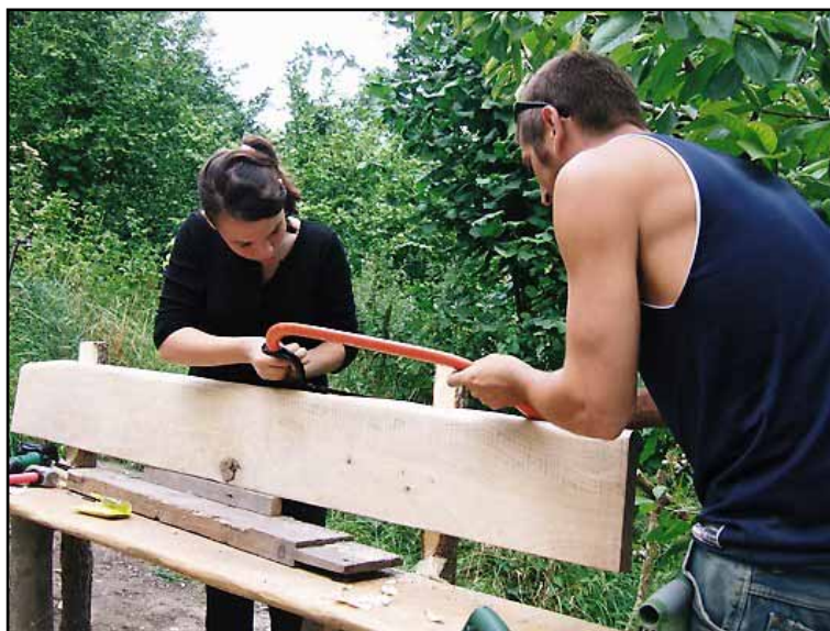
Falmer pupil learning how to make a bench