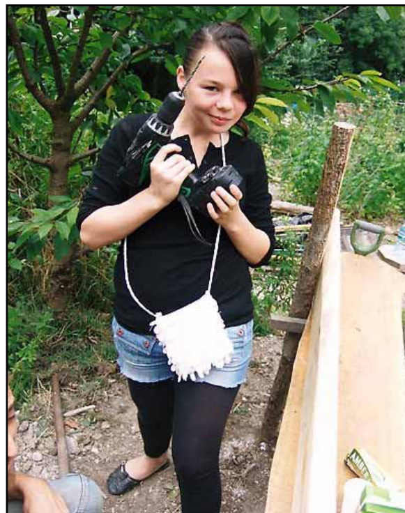
Falmer student learning woodwork skills building a bench