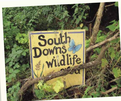
Over 60 species of birds have been heard or spotted on or around the Forest Garden