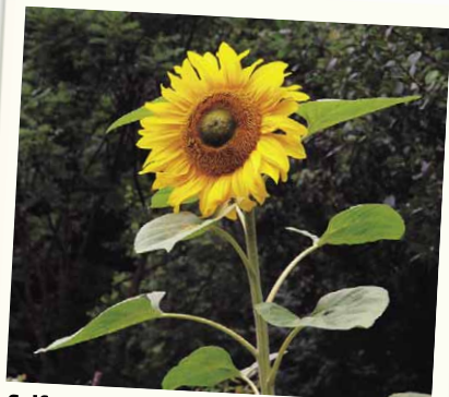
Self-sown sunflowers add colour to the plots. Birds love them!