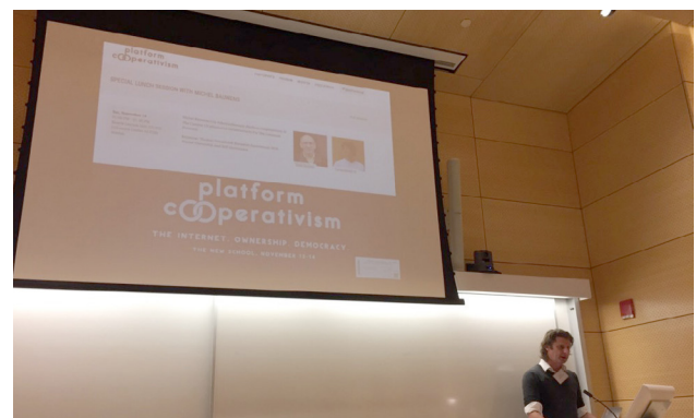
2. Thomas Dönnebrink @ PlatformCooperativism Conference in NY