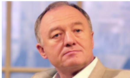
Ken Livingstone.

Ken Livingstone, 62, has dragged the capital to the top of the major world cities' environment league. He shocked the more timid Tony Blair and Gordon Brown when he set an ambitious 60% CO 2 reduction target by 2025 - and now he is championing renewables, energy from waste, heat and power systems, and ways