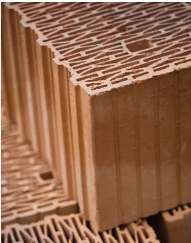
Above: Aerated clay 'Ziegel' block produced by Thermoplan Right: Block is laid into thin-bed mortar on site