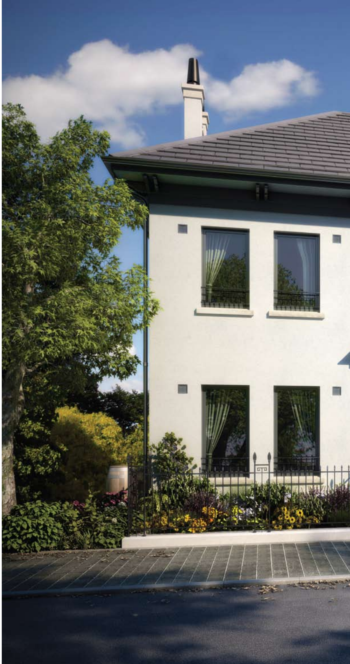
Rendering of 'The Natural House' designed by The Prince's Foundation for the Built Environment