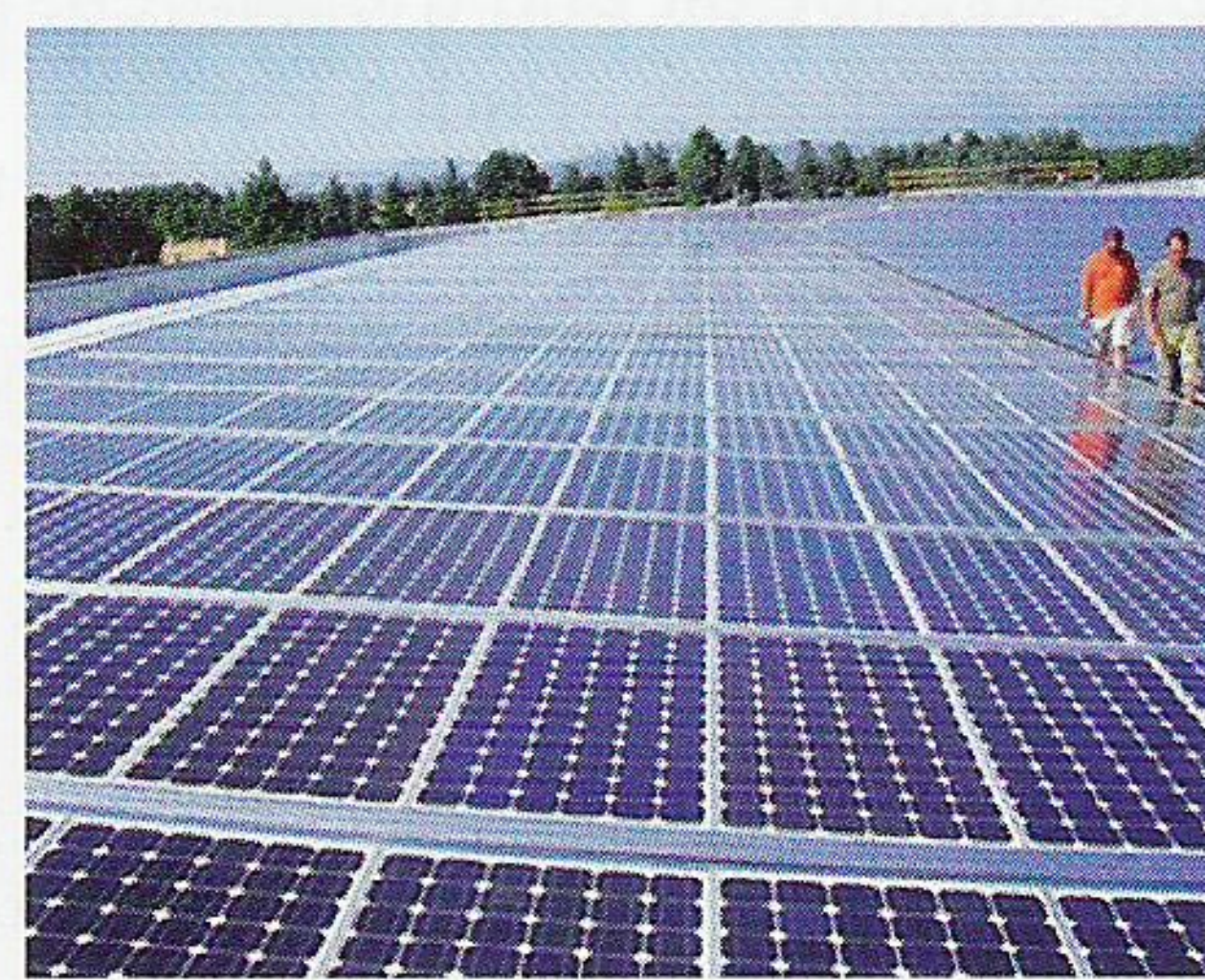
Damanhur's new solar panels

Solera, the alternative energy firm at Italian Ecovillage Damanhur, is preparing to install the community's largest solar panel system yet.