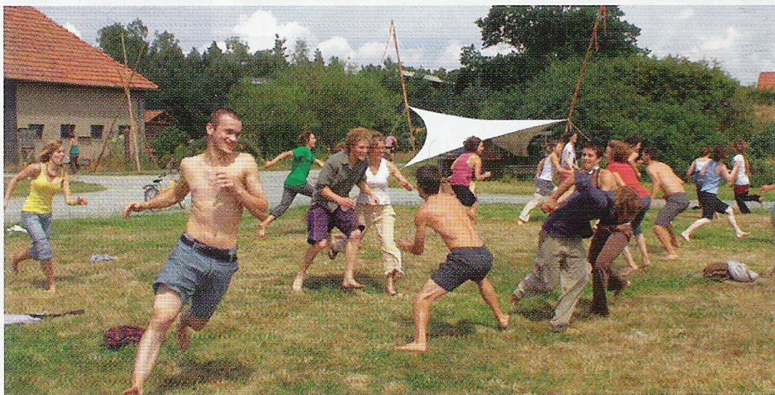
The students at Sieben Linden enjoy their time by playing games

Two dreams were realised when 45 'Students of Sustainability' (SOS) from eight countries, gathered at the Ecovillage of Sieben Linden, Germany, in July 2009 at an international young people's week.