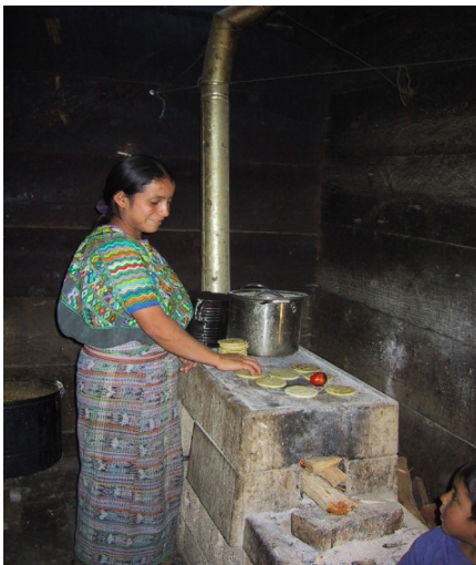
Figure 1: A well-designed chimney stove disseminated by HELPS International in Central America

In theory, a chimney stove seems a perfect solution. With nowhere else to go, the smoke vents into the open air outside the house. A well-constructed and maintained chimney stove can get rid of most of the smoke.