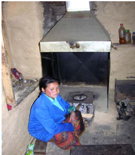
Figure 3 Woman sitting beside smoke hood, Nepal.

In Kenya, a well-known low-cost upes stove is built under the hood in place of the open fire, as in Figure 2. The upes is a well accepted ceramic stove which can be built into a base, with the hood set over the top to provide a neat safe environment – reducing the risk of burns and reducing the fuel costs. Currently, another type of stove, built on a principle called a 'rocket' stove, is being researched. If this research proves successful, the stove will reduce emissions and fuel costs, and the smoke hood can still be used for venting any residual smoke up the smoke hood. The smoke hood is sufficiently versatile to allow these changes to happen.