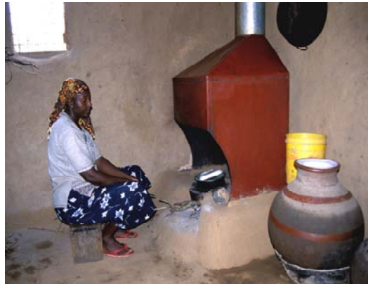
Figure 2: Woman sitting beside smoke hood, Kenya

Technically, the most important factor is the ratio of the area of opening to the flue cross-sectional area – ideally a ratio between 1:10 and 1:7 – the larger the better within these ratios. The flue must be tall enough to prevent 'blow back' into the room, and to keep the hot gases away from any inflammable roofing materials.