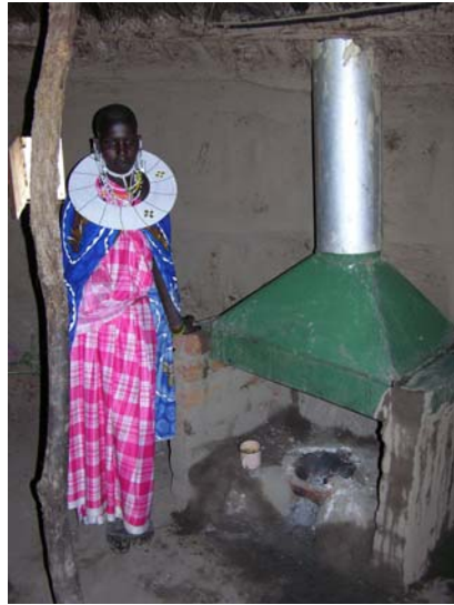
Figure 4: Maasai woman standing beside her smoke hood, Tanzania.

In Nepal, the traditional stove is a three-legged tripod with a circular metal ring on the top where the pots can sit. By building around the back of the stove, more heat is directed at the pot, increasing efficiency, whilst those sitting around the stove can still see the flames (Figure 3). The dry-stone walls of the houses have been insulated as part of the project, as shown around the smoke hood in Figure 3. This means that less heat goes out through the walls, compensating for the heat lost through the chimney in the vented smoke.